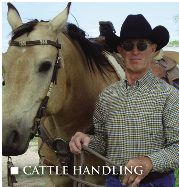
■ CATTLE HANDLING