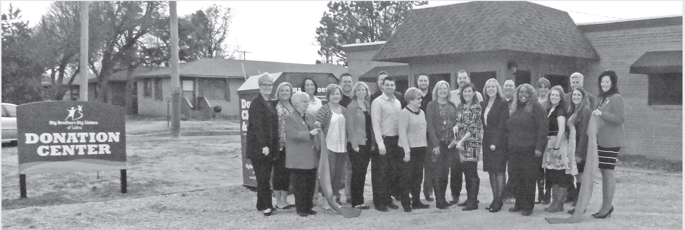
Big Brothers/Big Sisters opened a new Donation Center at 413 E. Prescott and celebrated with a Chamber ribbon cutting.