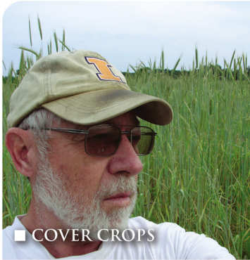
■ COVER CROPS