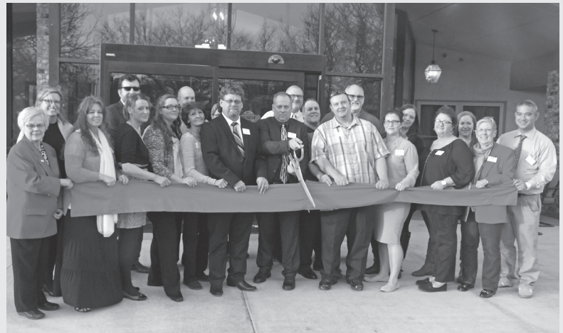
As part of their recent open house Smoky Hill Health & Rehabilitation , 1007 Johnstown, celebrated with a Chamber ribbon cutting.