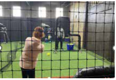
Answer: The Yard - Downtown Salina!