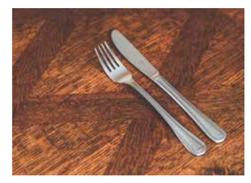
SAYP Lunch Club also met at Longhorn Steakhouse on September 20th!