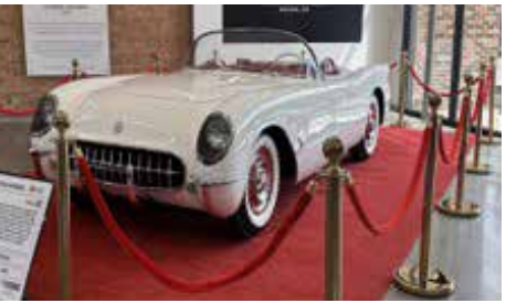
Answer: The Corvette exhibit at The Garage!