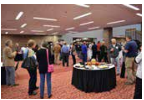
Answer: Lobby of Tony's Pizza Events Center!