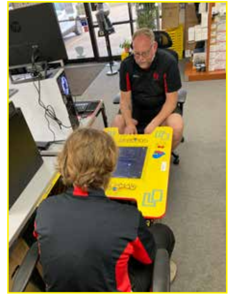
Thank you to JAB-IT for hosting a Game Night in September – a fun event with board games, arcade game contests, pizza and snacks.