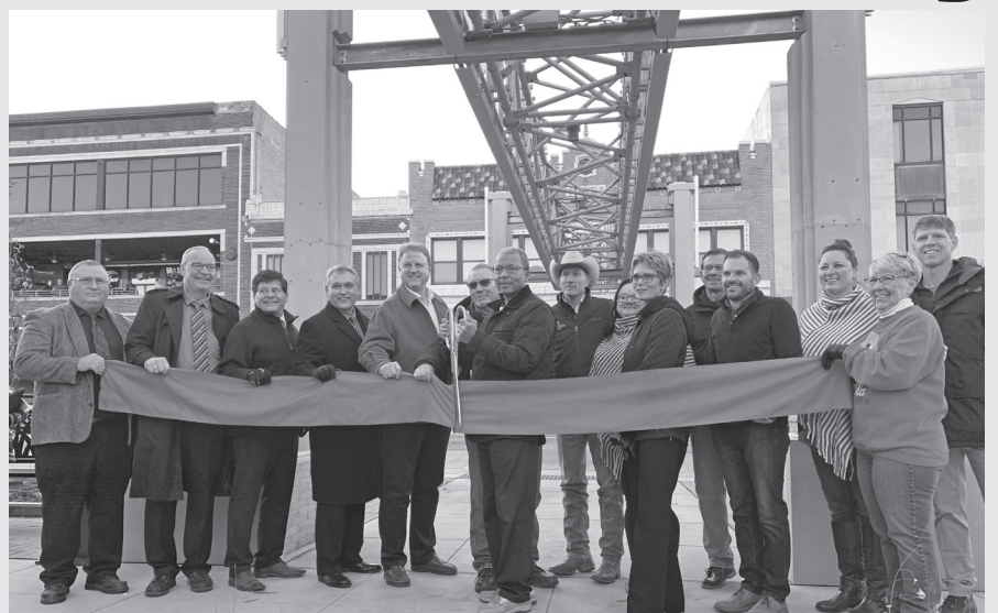
The much-anticipated Downtown Streetscape opening was celebrated with a ribbon cutting!